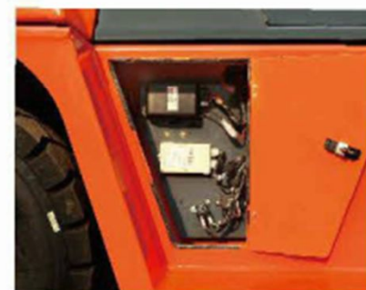
独立集成电控箱 Independent integrated electric cabinet