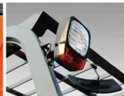
标配LED信号灯 LED signal (standard configuration)