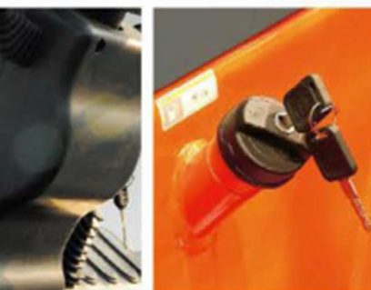
燃油箱盖带锁 Locked fuel tank cover