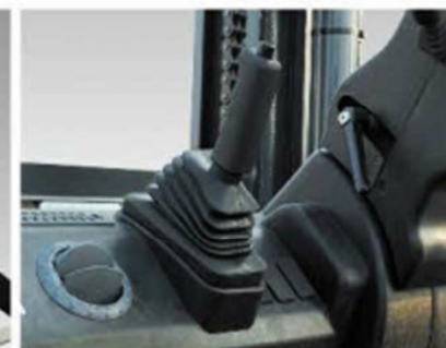
棘齿式驻车制动器 Ratchet type parking brake