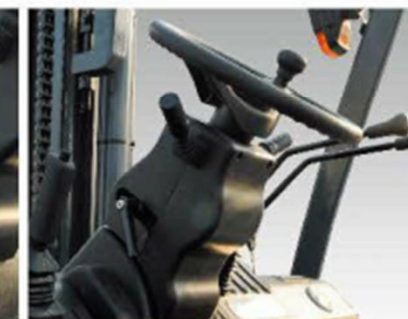
智能换挡 Intelligent gear shifting